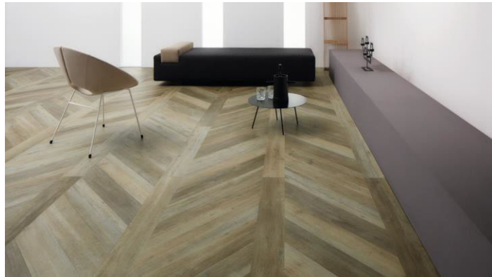
Hungarian Point Laying Option 2

Note: As with any geometric design, irregularities or undulations in the subfloor can result in the bond of tiles or planks drifting during installation. This is particularly important with the installation of Hungarian point planks if the points of the planks are to meet consistently and particular attention should be given to the preparation of the subfloor to ensure that the highest level of subfloor regularity is achieved i.e. within SR1 surface regularity standard