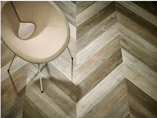
Hungarian Point Laying Option 1